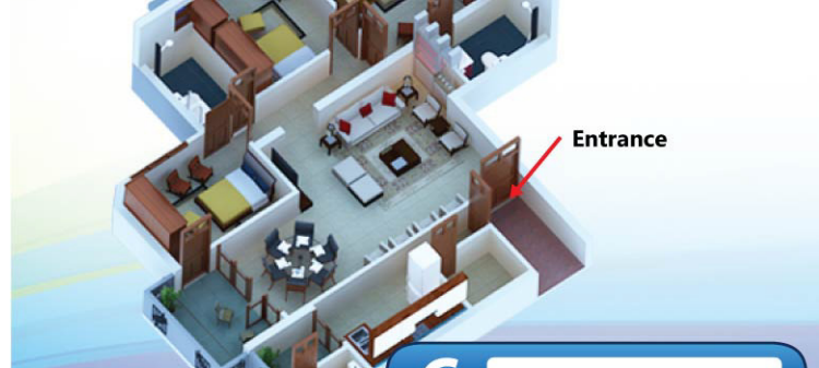
E 1223.0 SQ.FT-3 Bedrooms