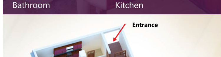
A 1290.0 SQ.FT-3 Bedrooms