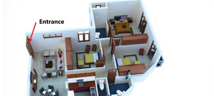
H 1257.0 SQ.FT-3 Bedrooms

We are proud to present our latest project in kolonnawa "Rush Court 2" we are offering our 21 years experience in the construction field and to purchase a property in kolonnawa built with the finest materials in the modern design for very reasonable budget.