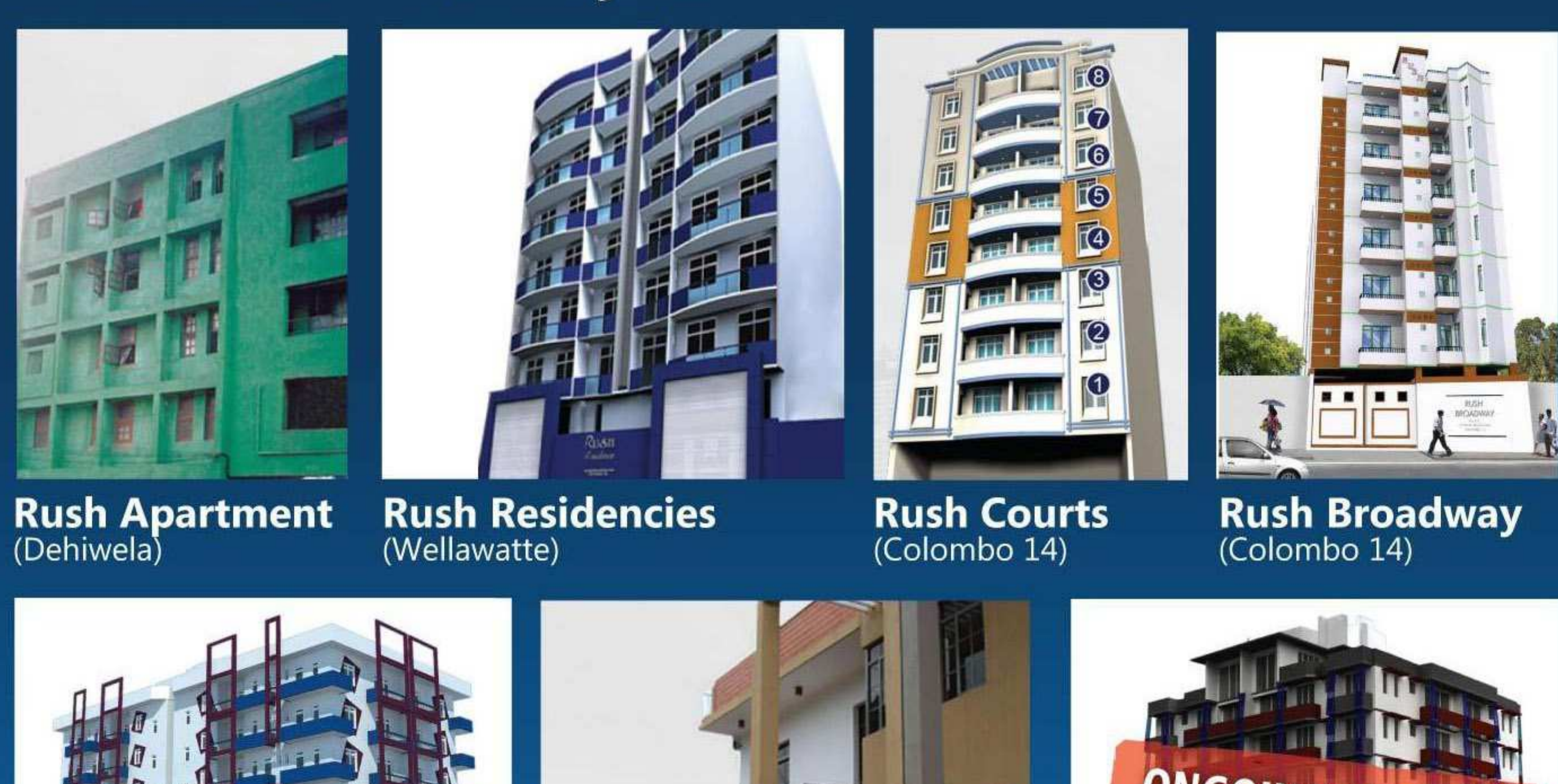
Rush Apartment (Dehiwala) Rush Residencies (Wellawatte) Rush Courts (Colombo 14) Rush Broadway (Colombo 14) RUSH Residencies (Dehiwala) Rush Villa (Saranakara Road, Dehiwala) Rush EbeneZ (Dehiwala)

TO RESERVE RUSH TO: 0777 666 699 / 0773 185 566 0773 559 382 / 0773 747 174 0775 595 007