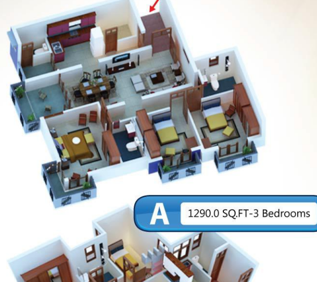
A 1290.0 SQ.FT-3 Bedrooms