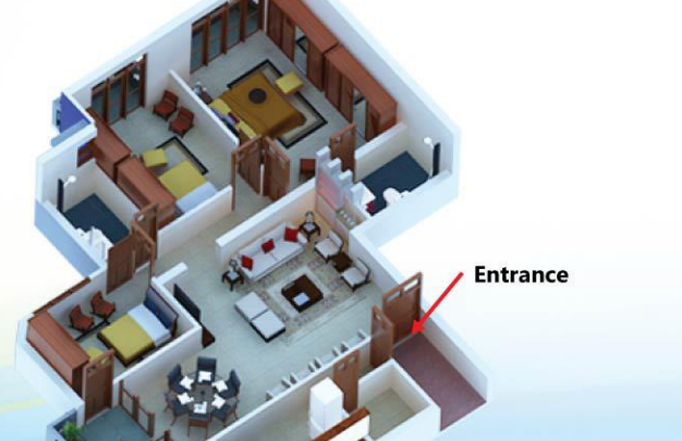
C 1306.0 SQ.FT-3 Bedrooms