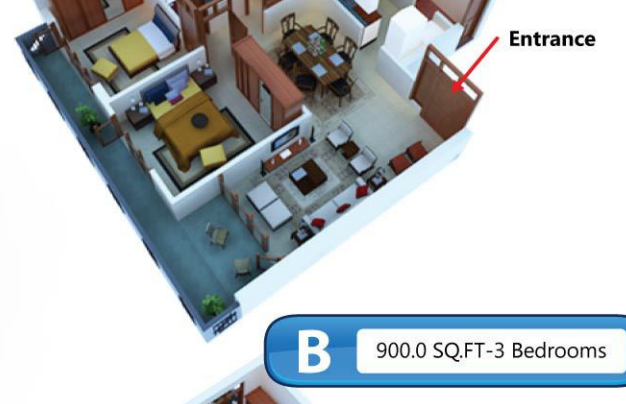
B 900.0 SQ.FT-3 Bedrooms